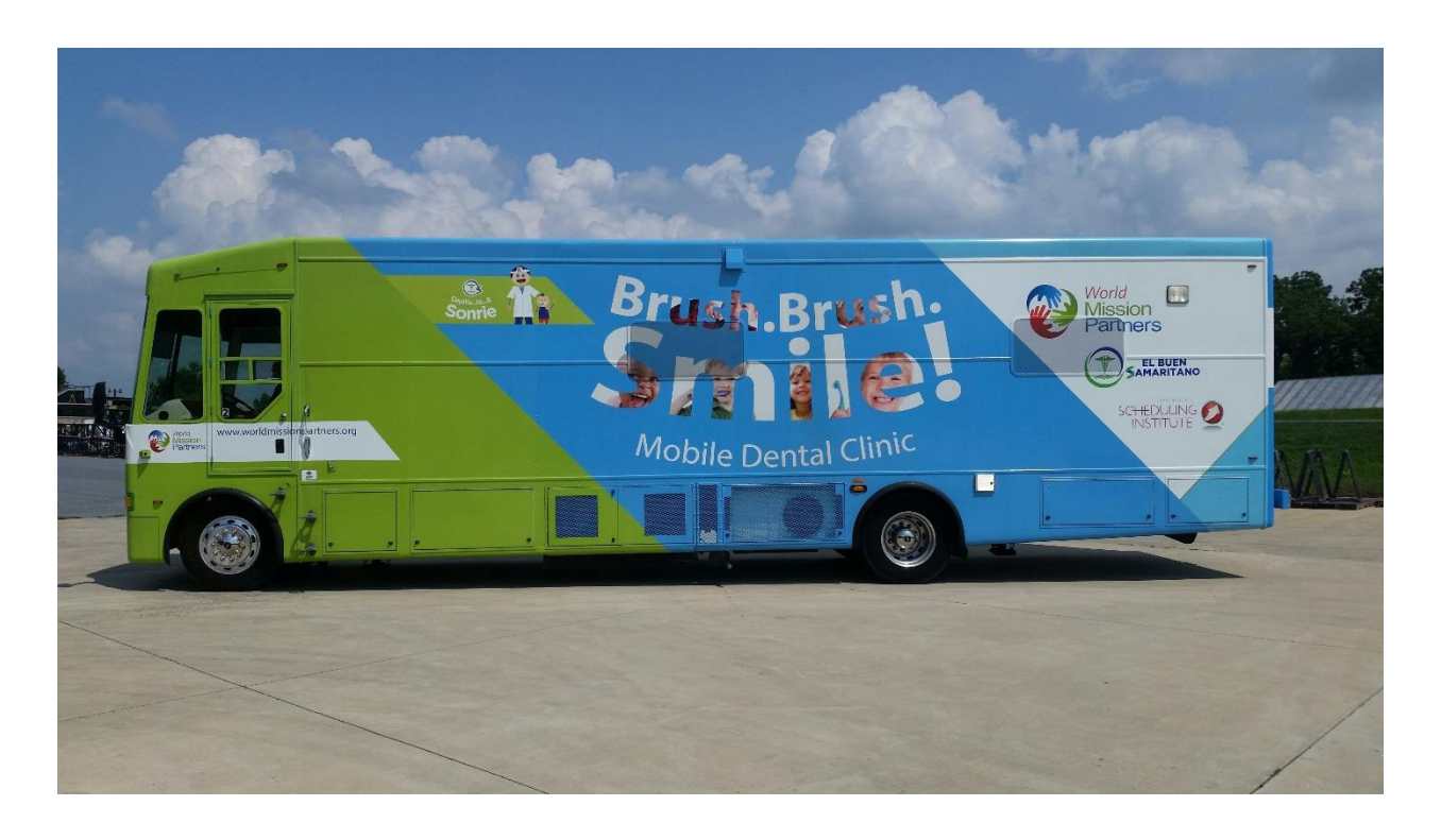
Option 1: The Mobile Unit (This is our greatest need for teams)

Serving in the mobile unit, you and your team will travel to the Bateyes and host a medical or dental clinic. Dental clinics are held on a donated RV outfitted with two dental chairs. Mobile medical clinics are held in a community center or church located in the Batay. This mobile option offers you the chance to serve the most people during your trip.