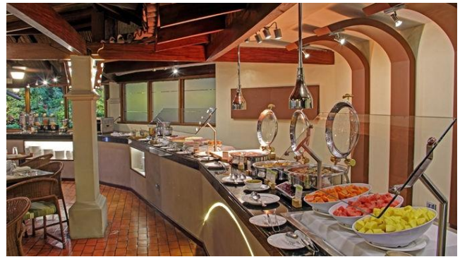
Doubletree by Hilton http://doubletree.nezko.com/doubletree-by-hilton-hotel-cariari-san-jose-costa-rica