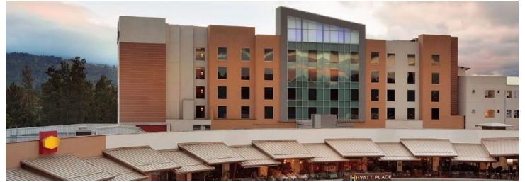
Hyatt Place Hotel Pinares http://sanjosepinares.place.hyatt.com/en/hotel/home.html